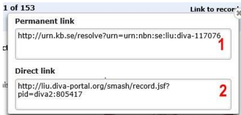
Image 4. Links to the post in DiVA.

There are two different links to a post in DiVA. The first one (number 1, image 4) is the permanent link to the post in DiVA. This link goes via a resolver at the National Library in Stockholm. We strongly recommend that you use the permanent link when linking to a post in DiVA. The second link (number 2, image 4) is the direct link to the post in DiVA and is not secure in a longer perspective. Never use the direct link when linking to DiVA.